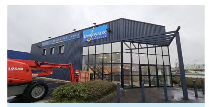
Opening of the new dealership, PCREC, in Cholet (West France).