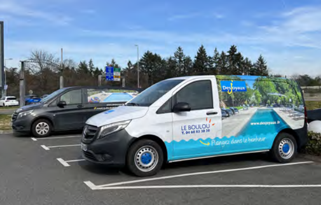
New graphics for Maoline Piscine 66 in Le Boulou (South France), which thought of every detail, including blue hubcaps and headrest covers featuring the logo. Gorgeous!