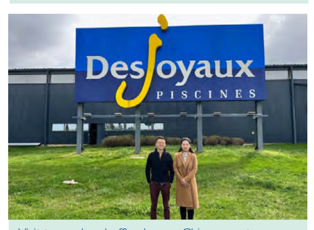
Visit to our head office by our Chinese partner.