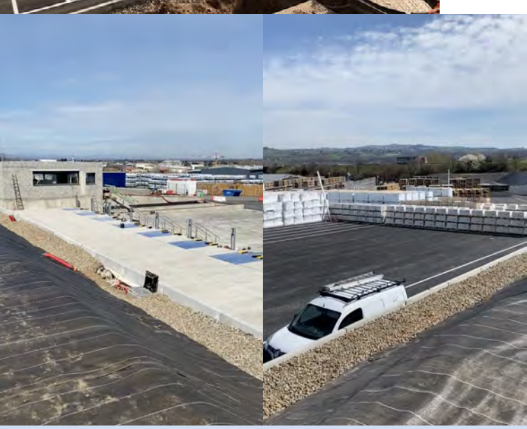
Completion of construction for the new storage area and progress on the construction of the future receiving docks