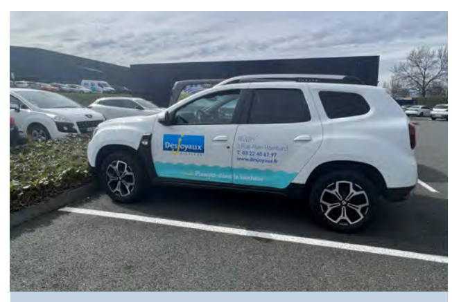
New graphics for Abam Piscines in Rivery (North France).