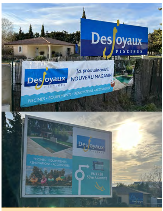
New signs for a new shop for Piscines Sud Evasion in Salon-de-Provence (SE France).