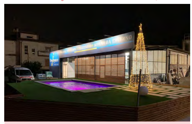
Grand opening of a new dealership by our Italian partner in Abruzzo.