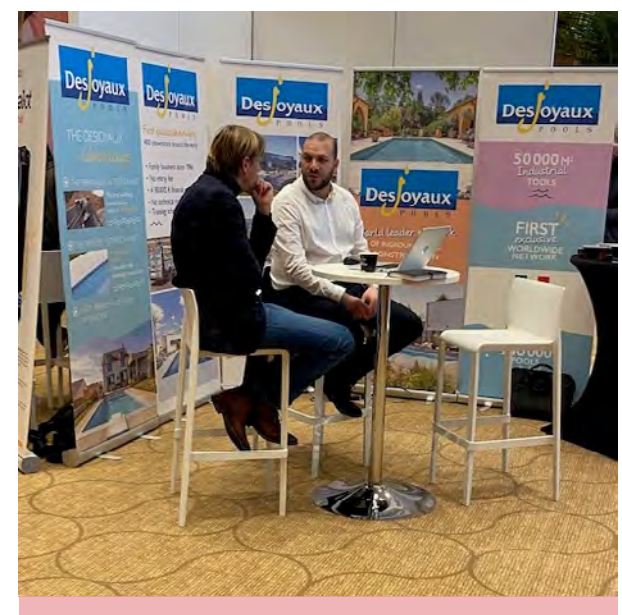
Presence at the Franchise trade fair in Amsterdam.