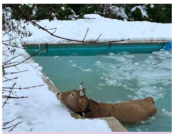
Taking a nice cool dip in this pool owned by a customer in the north of Spain.