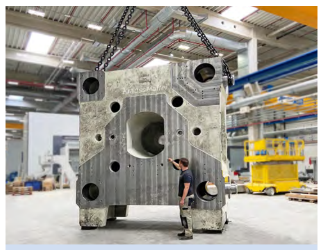
Delivery of one of the base segments of the new press weighing 6,000 tonnes.