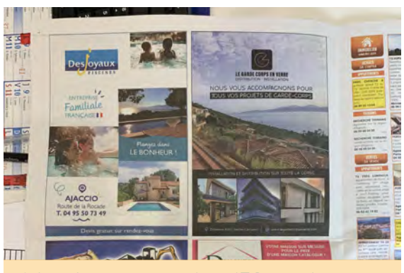
Advert in a newspaper from AT Piscines in Ajaccio (Corsica).