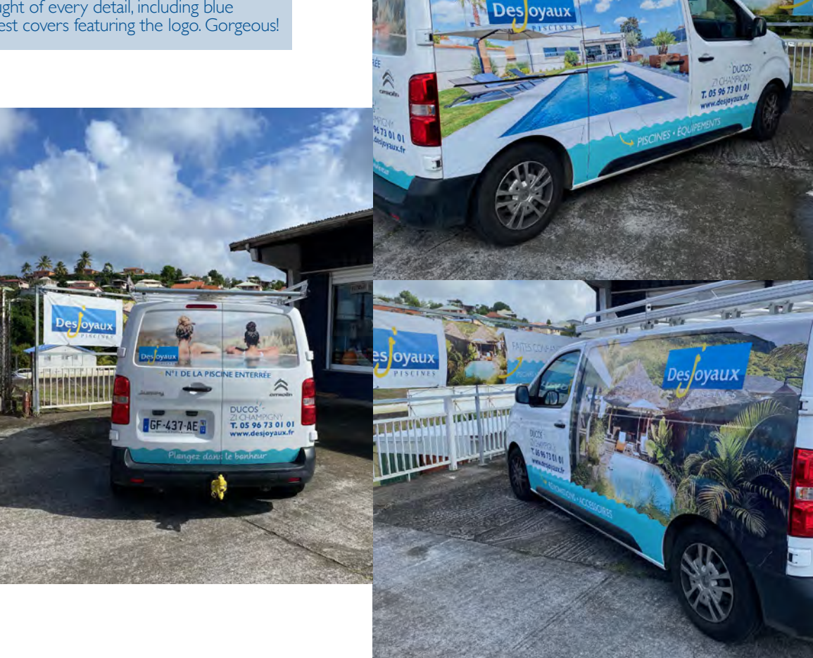
New vehicle for our partner in Martinique.