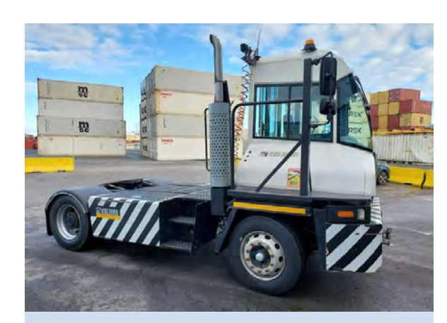
New Kalmar tractor unit for the logistics team.