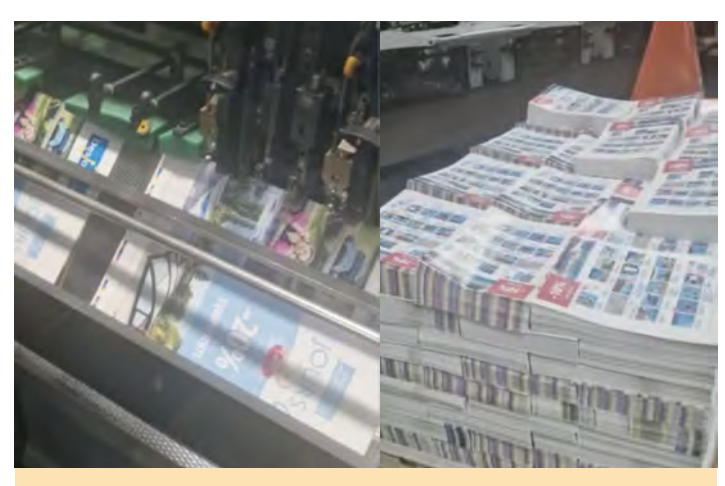
The brochure for the equipment sale being printed.