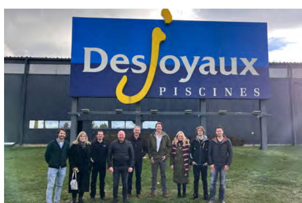
Visit to our head office by our English partners.