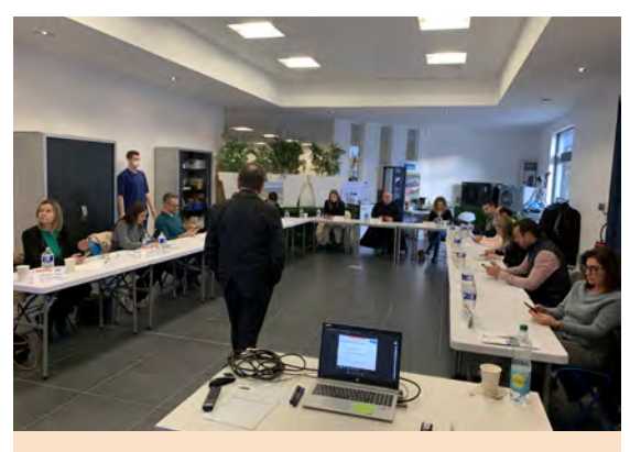
FADIN training: Continued